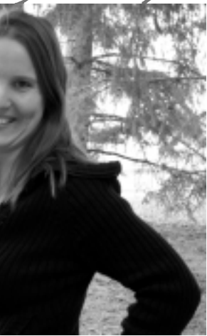
were younger you wish they would